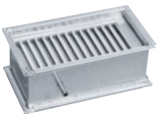
view of the underside of the eliminator with the condensate outlet